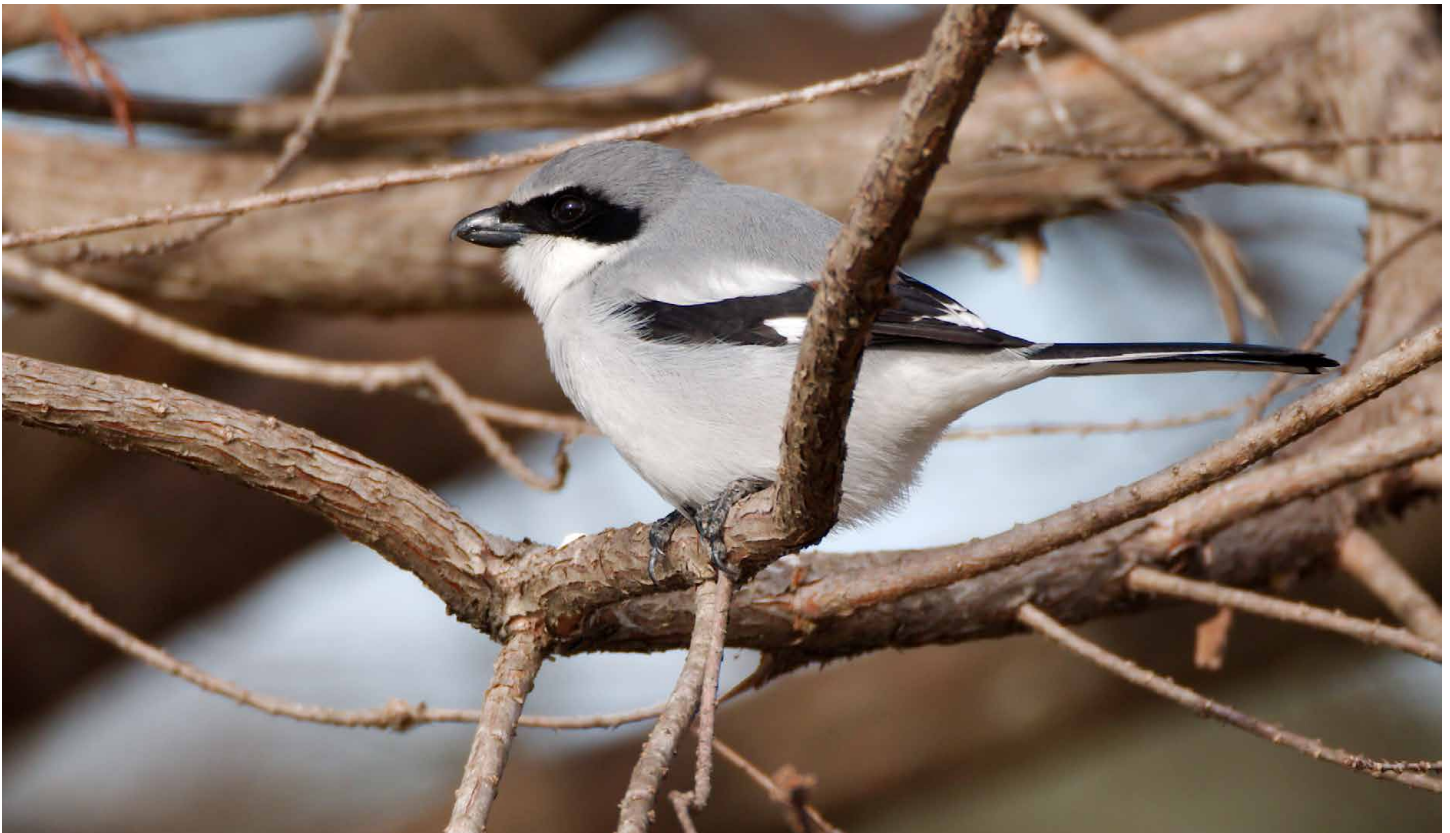
Loggerhead shrike in Louisiana