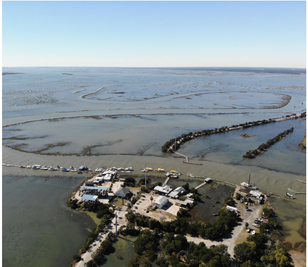
Wetland in Georgia

1133 15th Street, NW Suite 1000 Washington, D.C., 20005 202-857-0166